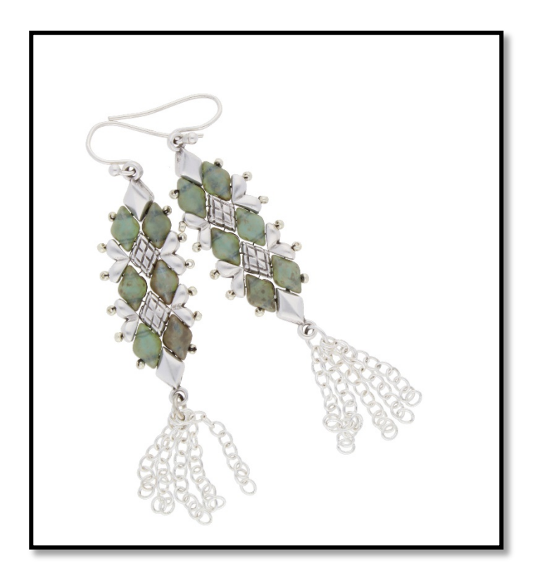
Easy stash-buster earring project!